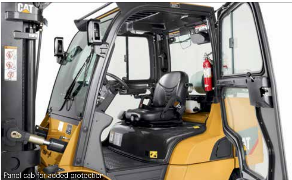
Panel cab for added protection