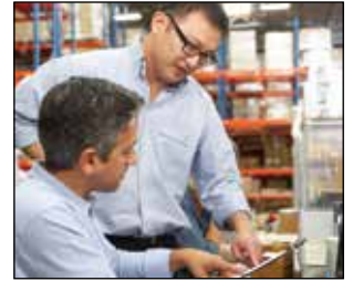
Custom financing packages