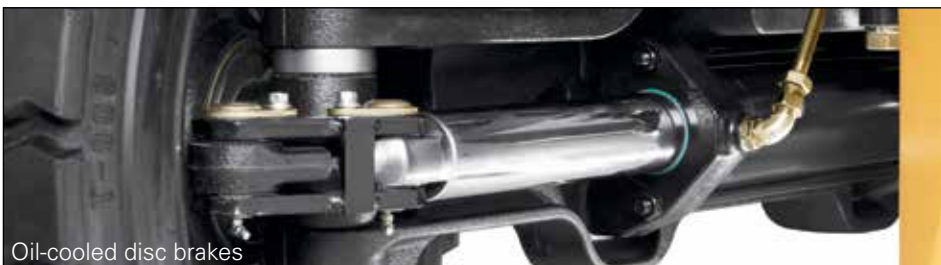
Oil-cooled disc brakes

Improve productivity and reduce the risk of premature component wear with optional wet-disc brakes, which include systems such as ProShift™ and controlled rollback to slow and control the lift truck.