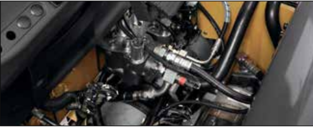
Factory warranty for added protection