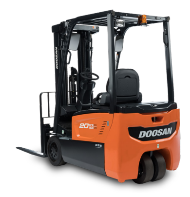
B15T/B18T/ B20T-7 3,000/3,500/4,000 lb. Capacity 3-Wheel Pneumatic Tire Electric, 36V/48V