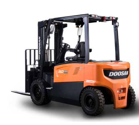
B40X/B45X/B50X-7 8,000/9,000/10,000 lb. Capacity Solid Soft Tire Electric, 80V