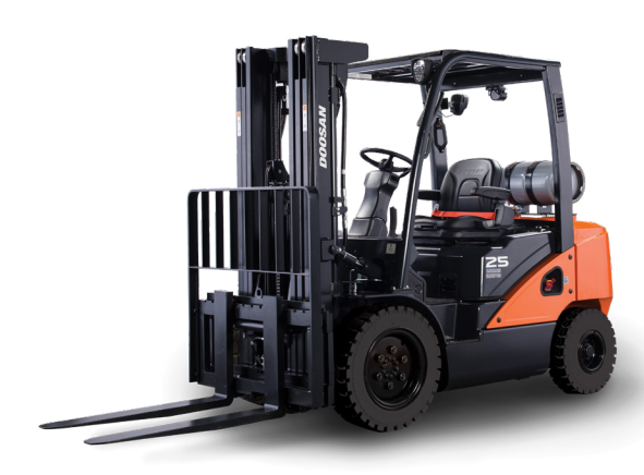
G20N/G25N/G30N/G33N/G35NC-7 4,000/5,000/6,000/6,500/7,000 lb. Capacity Pneumatic Tire IC (LP/DF)