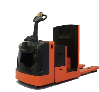
BWC33S-7 6,500 lb. Capacity Electric Rider Pallet, 24V