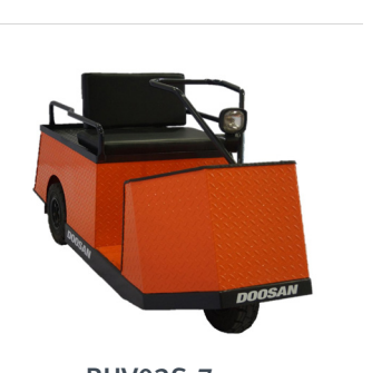
BUV03S-7 600 lb. Capacity Electric Personnel Carrier, 24V