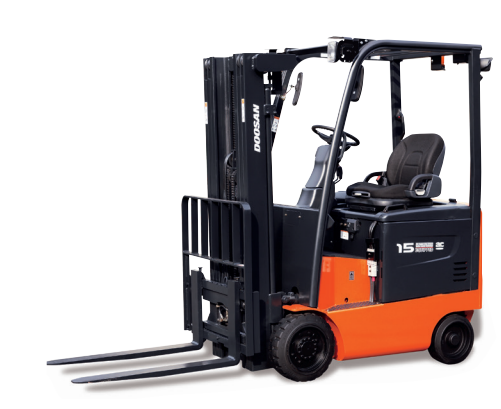
BC15S/BC18S-5, BC20SC-5 3,000/3,500/4,000 lb. Capacity Cushion Tire Electric, 36/48V