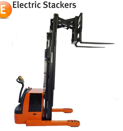
BWP17S-7 3,300 lb. Capacity Electric Walkie Reach, 24V