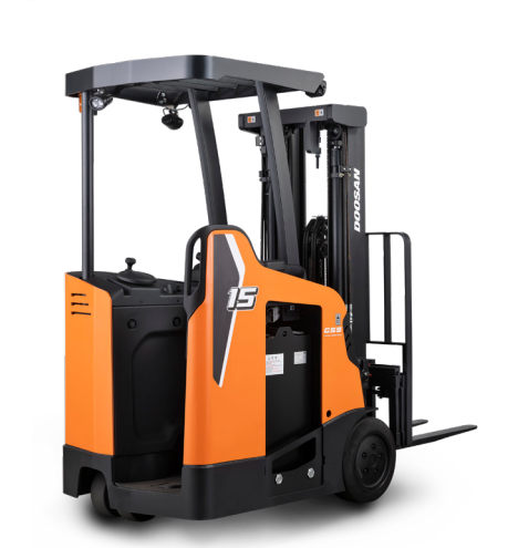
B15SU-9/B18SU-9/B20SU-9 3,000/3,500/4,000 lb. Capacity Cushion Tire Electric Stand-Up Rider, 36V