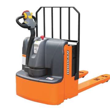
BW23S-7 4,500 lb. Capacity Electric Walkie Pallet, 24V