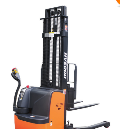
BWS17S-7 3,300 lb. Capacity Electric Walkie Stacker, 24V