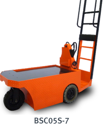
900 lb. Capacity Electric Stock Chaser, 24V