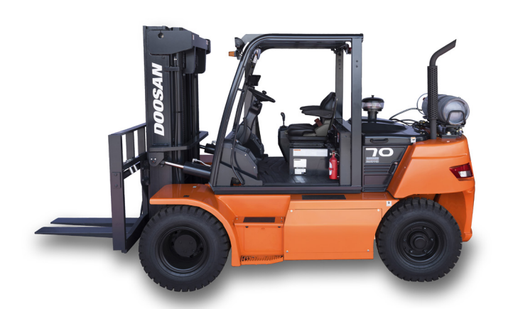
G60S/G70S-7 13,500/15,500 lb. Capacity Pneumatic Tire IC (LP)