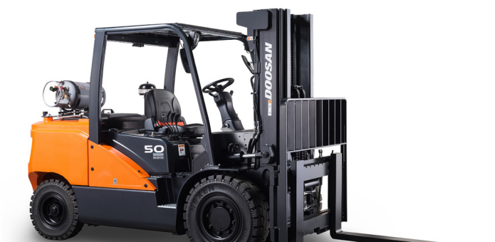
G35S/G40S/G45-7, G50C/G55C-7 8,000/9,000/10,000, 11,000/12,000 lb. Capacity Pneumatic Tire IC (LP/DF)