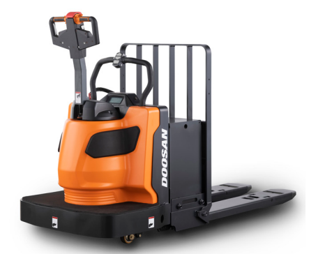
BER30-9/BER40-9 6,000/8,000 lb. Capacity Electric Rider Pallet Truck, 24V