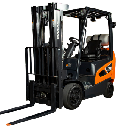
GC20S/GC25S/GC30S/GC33S-9 4,000/5,000/6,000/6,500 lb. Capacity Cushion Tire IC (LP)