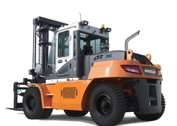
D100S/D120S/D140S/D160S-7 22,000/26,000/31,000/36,000 lb. Capacity Pneumatic Tire IC (Diesel)