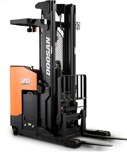
BR18-7 PLUS/BR20SP-7 PLUS 3,500/4,000 lb. Capacity Electric Pantograph Reach Truck, 36V