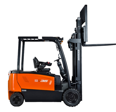
B22X/B25X/B30X/B35X-7 4,500/5,000/6,000/7,000 lb. Capacity Pneumatic Tire Electric, 80V