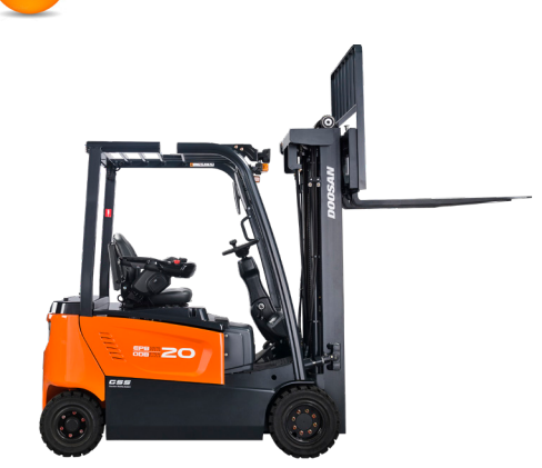
B16X/B18X/B20X-7 3,200/3,600/4,000 lb. Capacity Pneumatic Tire Electric, 48V