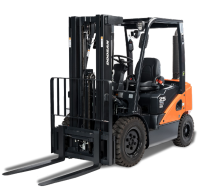
D20S/D25S/D30S/D33S, D35C-7 4,000/5,000/6,000/6,500, 7,000 lb. Cap. Pneumatic Tire IC (Diesel)