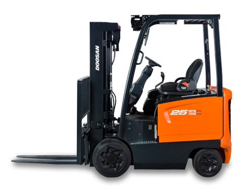
BC20S/BC25S/BC30S/ BC32S-7, BC25SE-7 4,000/5,000/6,000/6,500 lb. Capacity 4-Wheel Cushion Tire Electric, 36/48V