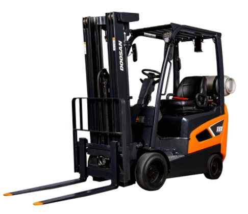
GC15S/GC18S/GC20SC-9 3,000/3,500/4,000 lb. Capacity Cushion Tire IC (LP)