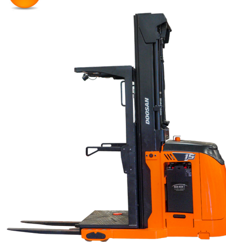
B150P-9 3,000 lb. Capacity Electric High Level Order Picker, 24V