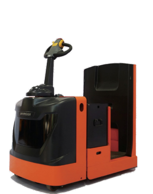
BWT45S-7 10,000 lb. Capacity Electric Tow Tractor, 24V