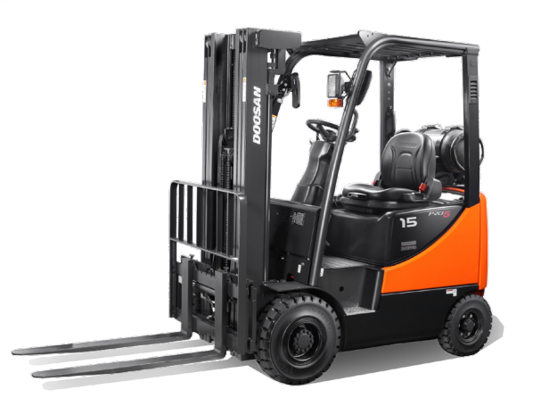
G15S/G18S/G20SC-5 3,000/3,500/4,000 lb. Capacity Pneumatic Tire IC (LP)