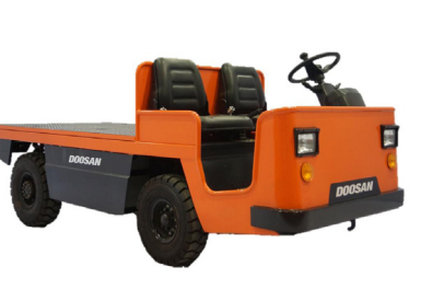
BBC23S/28S-7 4,400/6,600 lb. Capacity Electric Burden Carrier, 48V