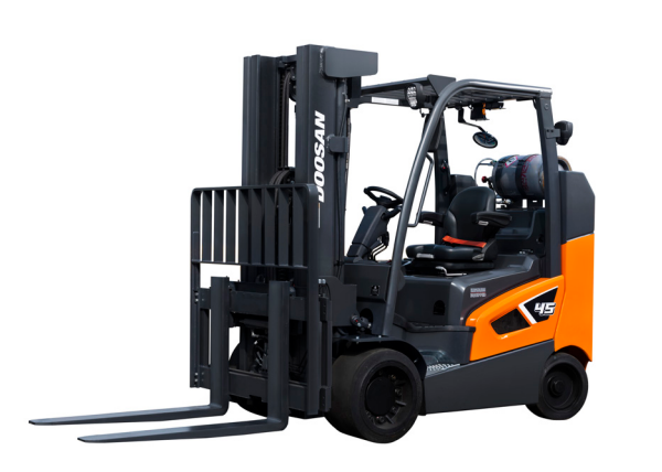
GC35S/GC45S/GC55C-9 GC35BCS/GC45BCS/GC55BCS-9 8,000/10,000/12,000 lb. Capacity Cushion Tire IC (LP)