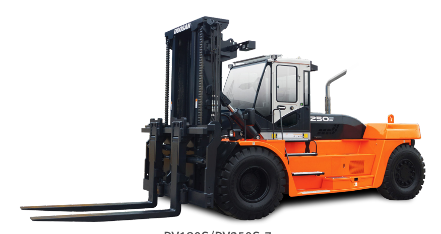
DV180S/DV250S-7 40,000/55,000 lb. Capacity Pneumatic Tire IC (Diesel)