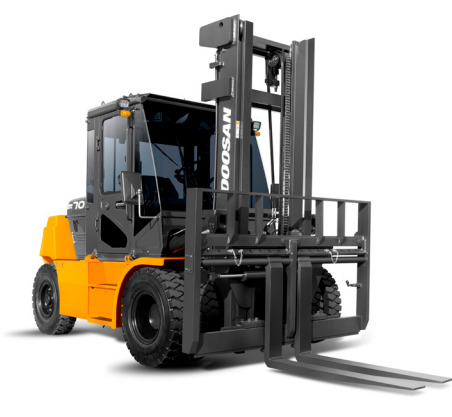
D35S/D40S/D45S, D50C/D55C-7 8,000/9,000/10,000; 11,000/12,000 lb. Cap. Pneumatic Tire IC (Diesel) D60S/D70S/D80S/D90S-7 13,500/15,500/17,500/20,000 lb. Capacity Pneumatic Tire IC (Diesel)