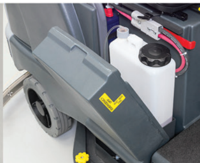
Removable, high capacity detergent cartridge for sustained flexible cleaning is available with optional EcoFlex™ System.