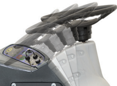
Clear-View™ design and adjustable tilt steering column enable an ergonomic ride for most operators.