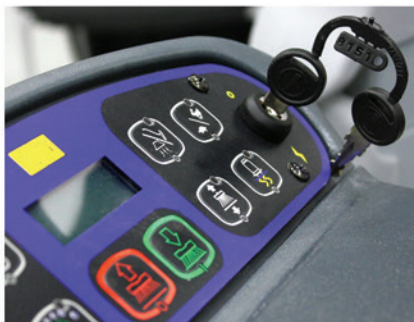
Large One-Touch™ controls make operation easy and accessible.