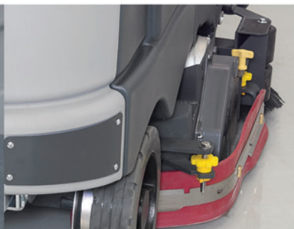
Powerful offset scrub deck provides edge and high productivity cleaning in a single pass.