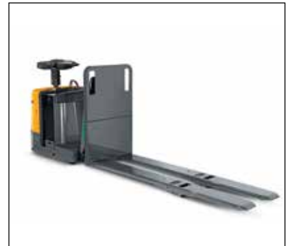
Thickest forks in the industry