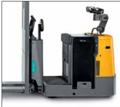
Spacious operator compartment