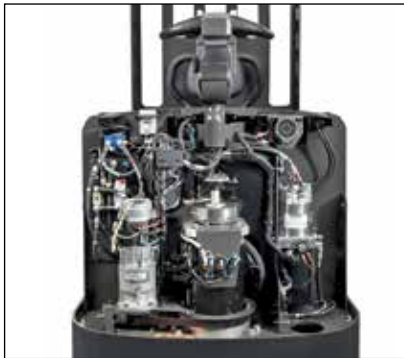
Easily accessible components