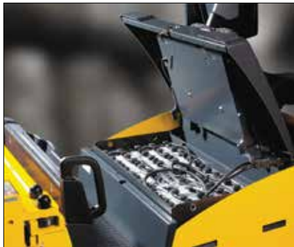
Longer operating times