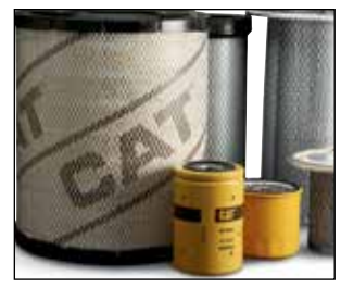
Genuine OEM parts