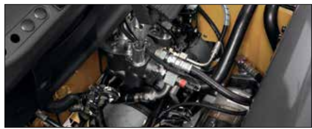
Factory warranty for added protection