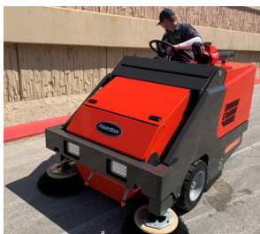
Ergonomics System Open cockpit with unobstructed view