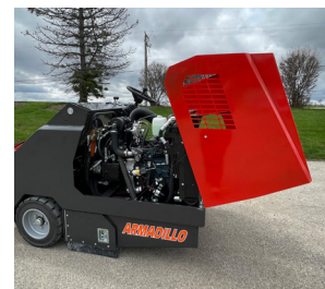
Maintenance Benefits Full engine access for easy serviceability