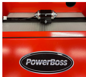
Heavy Duty Filtration Synthetic panel filter with aggressive shaker motor