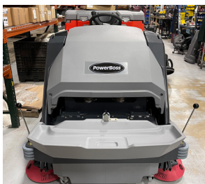
Manual Receptacle for Large Debris Disposal