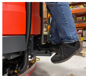
Safety Step for Unobstructed View Into the Recovery Tank