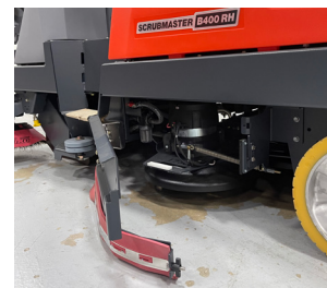
Hands Free Auto-Load/ Unload Disc Change