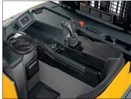
Multifunction control handle

Performance profiling allows you to customize the reach truck's drive and hydraulic settings based on your application, individual operator experience level and personal preferences. All display-based programming, performance and information requests can be performed with easily-accessible buttons.