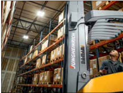
Overhead guard visibility